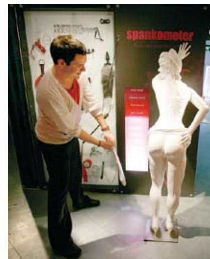
Visitors can try their hand at the Spankometer in the Fantasy and Fetish zone

Besides the lounge, there is the Amora Gallery, which is set up for talks and events. Then there is the Amora boutique, where you can find useful aids to put in to practise what you have just learned. □