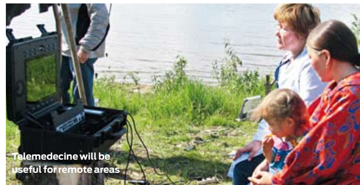
Telemedicine will be useful for remote areas

Home care, teleconsulting or distance learning applications may be put into practice at different levels. A popular use is of video communication resources is to share images between experts, such as live surgical operations, dermatology pictures or live images, X-ray and Digital Imaging and Communication in Medicine (DICOM) acquired data or other medical high resolution images. The sharing of images equates to an interview between doctors, experts and patients, and is much more efficient than a basic telephone call or email. It is also faster and sometimes more cost-effective than meeting in person. Multi-site videoconference makes interacting