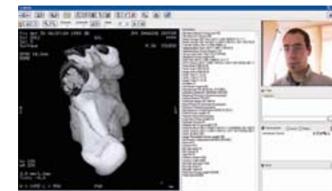
Screen test: DICOM viewer for quick analysis

* Scotty, a secure VC unit from the Tiara group of companies (Tiaracom), allows portable videocommunications for applications in remote areas. It is a fully equipped yet compact office unit for secure speech, data and video communication over Inmarsat. The kit includes a rugged notebook computer,